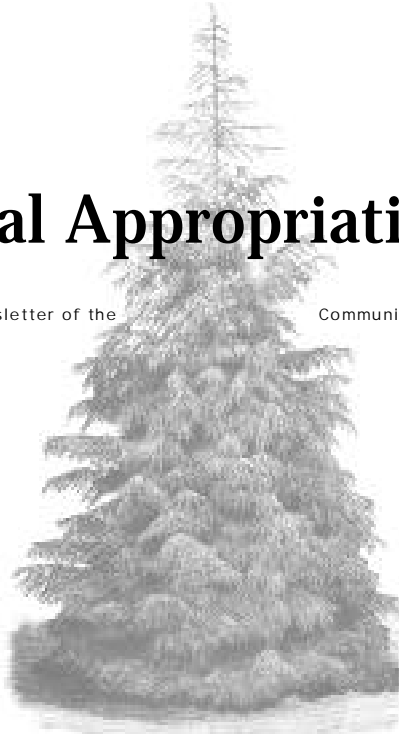
Vol.1, No.1 January 1999

The Interior Appropriations Subcommittees write the Interior and Related Agencies spending bill, which funds most agencies and programs critical to community-based forestry. The Interior spending bill funds 35 different agencies, including those in the Department